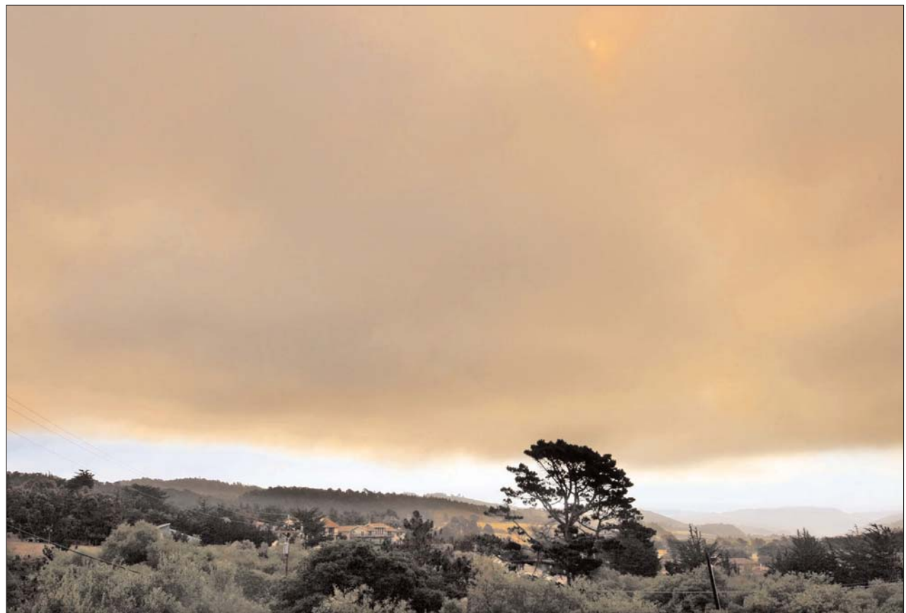
Heavy drift smoke from the 2,800-acre Lockheed Fire in Santa Cruz Co. blocks out the sun and settles in over Carmel Valley on Thursday.

Zack Cinek can be reached at udjzc@pacific.net or at 468-3521.